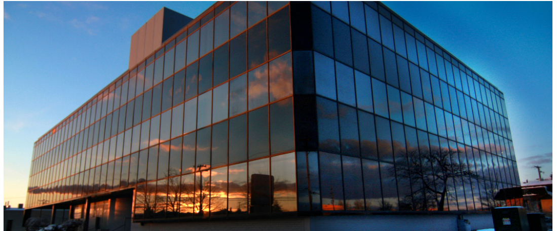
MG '08 New HQ